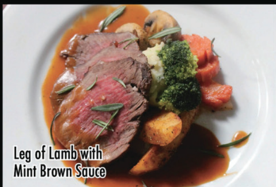
Leg of Lamb with Mint Brown Sauce