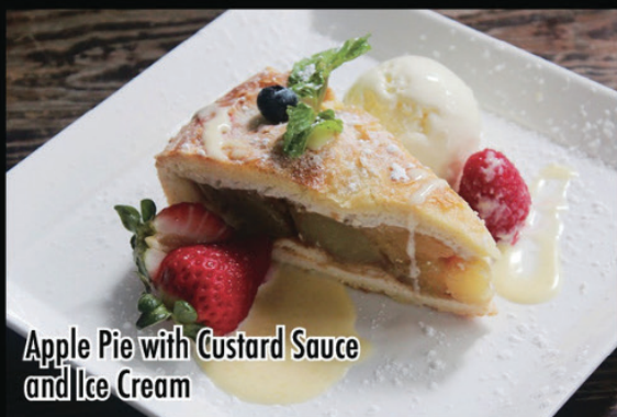
Apple Pie with Custard Sauce and Ice Cream