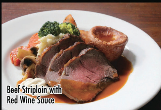
Beef Striploin with Red Wine Sauce